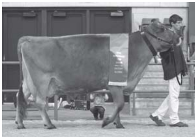
The Premier of the Southern National Brown Swiss Show was held October 8-12 at the Georgia National Fair.

Good crowds also at the Sunbelt AG Expo in Moultrie, GA.