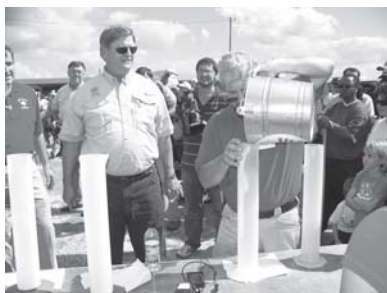
Commissioners of Agriculture from Florida, Tennessee, Alabama, and South Carolina participated in the annual milking contest...